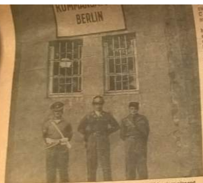
RUSSIAN WALK LEAVES THREE ON BASE . . . This stern-changed threesome used to be a foursome. Together, the quartet—representing the Big Four nations—would stand guard happily at the Berlin Kommandatura, seat of the Allied governing body in Berlin. But the disarmed Russians walked out of the council, took their sentry with them and said they weren't coming back. So that left the (left to right) British, American and French representatives in charge.