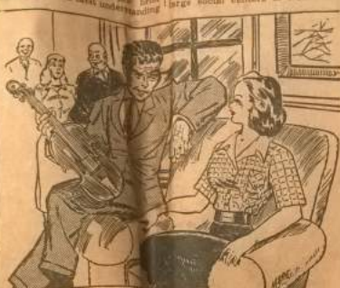
Louis had come over to sit casually on the arm of the chair, "Did you like my playing?" he asked politely.

Marya sensed that this was the real Louis. Louis with the laughing black eyes and the tight ringlets of raven hair. When Louis stopped playing, the others were noisy again, but Marya sat quietly in the chair, contemplating the magic artistry of