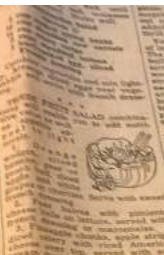
Serve a salad for lunch and get your outdoors the easy way.