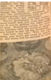
Serve a salad for lunch and get your outdoors the easy way.