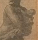
Mrs. Neanderthal ... they couldn't take it ...