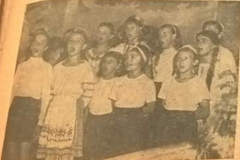
OF THESE WE SING . . . Far from the terrors and persecutions of Soviet Russian enemies, sons and daughters of anti-Soviet Russian families sing a loud and clear anthem of liberty at the annual children's festival held at Tosa farm, the Tolstoy foundation refuge for White Russians in Rockland county, N. Y. It was at this farm that Mrs. Oksana Kasenkina first sought refuge from the Soviets.

HOW TO BE HAPPY THOUGH IN POLITICS . . . New York's Governor Thomas E. Dewey momentarily displaced the crown of state and campaign strategy with the news and aggravations of golf. The Republican candidate for the presidency is shown here making—or at least attempting—a long putt on the last green of the Albany country club. He soon will forsake the greens for the political rough when he starts the fall campaign that he hopes will win the presidential election for him.