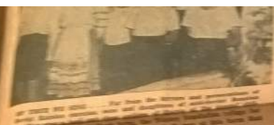
For them the British and American troops of the Berlin garrison were all dressed in military uniforms. The British troops are seen at the top left. The American troops are seen at the top right. The British troops are seen at the bottom left. The American troops are seen at the bottom right.