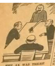
THE AX WAS THERE