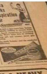
Serve a salad for lunch and get your outdoors the easy way.