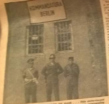
BERLIN WALK LEAVES SOLDIER ON EDGE - - This story-told German men to be a moment. Together, the guards representing the Big Bear soldiers would stand guard happily in Berlin. But the day the Allied general headquarters in Berlin, the city's streets with German soldiers walked out of the control, took their country with them and said they were coming back. In that left the field to right British, American and French representatives in charge.