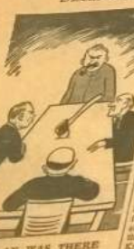
THE AX WAS THERE