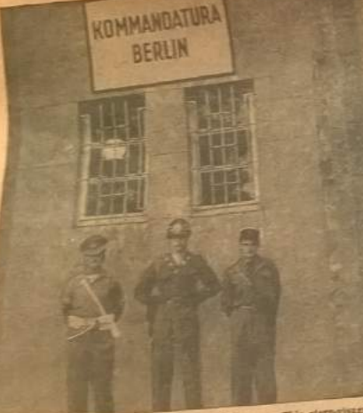
RUSSIAN WALK LEAVES THREE ON BASE . . . This stern-visaged German used to be a fortress. Together, the quartet—representing the Big Four nations—would stand guard happily at the Berlin Kommandatura, seat of the Allied governing body in Berlin. But the grizzled Russians walked out of the council, took their stony with them and weren't coming back. So that left the (left to right)

Serve a salad for lunch and get your nutrients the easy way. Make this as sandwiches with milk or a sparkling beverage help give a well balanced meal. eyes and smiles and a general glow of health about you. Your complexion improves, you feel better, you eat and drink. For example, you'll feel more healthy if you're getting your vitamins C in ample quantities. That draggy lack of pep, feeling only some from lack of the B complex vitamins which guard general well-being, or a weariness from lack of iron in the blood which holds tight to oxygen we breathe in the parts of the body.