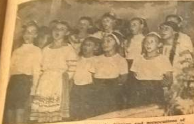
OF THESE WE SING ... Far from the horrors and persecutions of ...