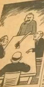
THE AX WAS THERE