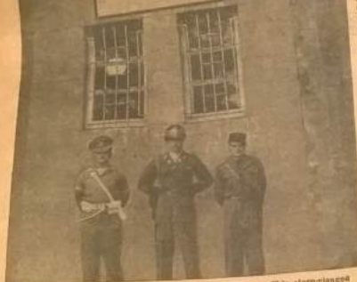
RUSSIAN WALK LEAVES THREE ON BASE . . . This stern-visaged threesome used to be a foursome. Together, the quartet—representing the Big Four nations—would stand guard happily at the Berlin Kommandatura, seat of the Allied governing body in Berlin. But the disgruntled Russians walked out of the command, took their sentry with them and said they weren't coming back. So that left the (left to right) British, American and French representatives in charge.